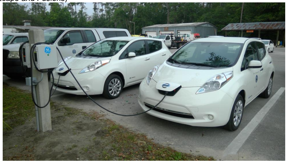
Two of our Nissan Leaf Electric sedans and charging infrastructure

This program is aimed at reducing petroleum fuel usage through the use of alternative fuels and alternative fuel vehicles, for example Bio-diesel, Hybrid and electric vehicles. (Toyota Prius, Nissan Leaf, Ford Escape and Fusions)